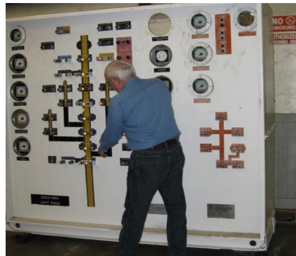
Control panel for subsea control unit

“Course is excellent and very informative and therefore nothing I would change.” Drilling Contractor, November 2010