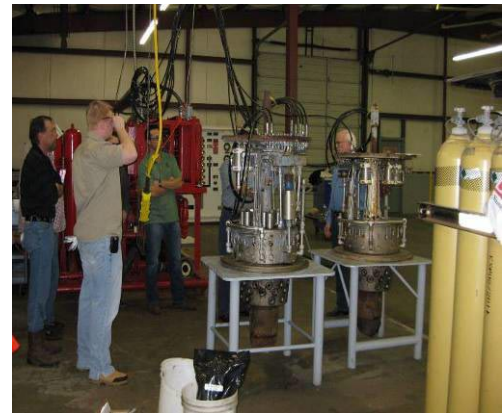
Students troubleshooting subsea control pods during the Subsea Controls course

“This is the most beneficial course I have ever attended. I am leaving with a better understanding in many areas. ... money well spent. Looking forward to other courses. (instructor) did a fine job in every aspect, second to none! Thanks!” Drilling Contractor, March 2010