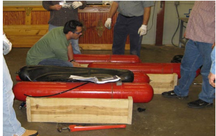
Students getting familiar with some accumulator bottles and a bladder

Drilling equipment services, February 2009