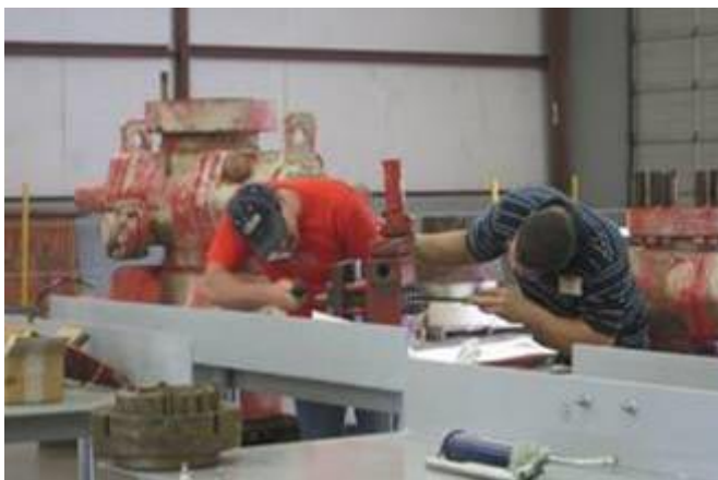
Students applying course material “hands-on”

“...Another great course - congrats on the new facility - very nice. I will be back again.” Major operator, January 2010